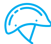
BIKE HELMET IF YOU HAVE ONE

Helmets are available for loan from the arena if required.